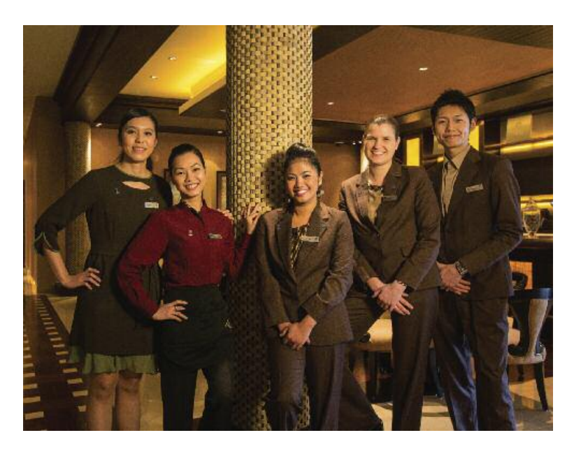
CULTURAL MOSAIC Above: The Sheraton Macao currently employs a team of 1,600 people, a number that is set to grow with the opening of the Earth Tower. Between them, the multicultural staff speak 19 languages. Right: Cooking up a storm in a hotel kitchen.

omewhere beyond or below the busy lobby of the Sheraton Macao's Sky Tower, an army of employees is at work. Some are busy sorting and delivering the 10,500 kilos of laundry processed daily offsite. Others are handling luggage, which arrives in such huge volumes that the hotel tags each piece with a bar code before placing it on a conveyor belt to a central distribution system. Still others are bustling back and forth with food, which amounts to something in the order of 6,000 eggs, 1,600 pieces of bread, 300 kilos of beef, 550 kilos of pork, and dizzying quantities of chicken, lamb, and sundry ingredients consumed every day.